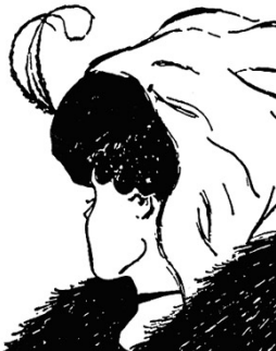
Old and Young Woman Illusion